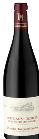
DOMAINE TAUPENOT MERME Nuits Saint Georges 1er Cru, Les Pruliers